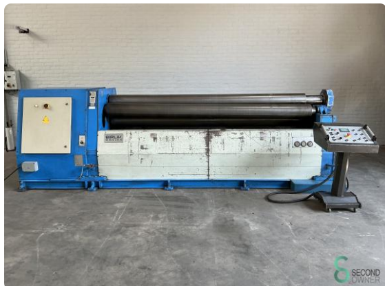
Plate roller - Birlik HSM4, 3100x6/8mm