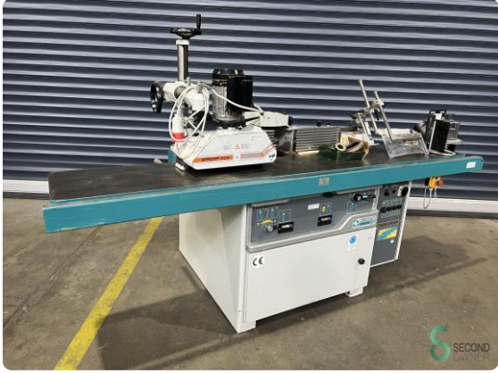
Table milling/spindle milling - Griggio T 45