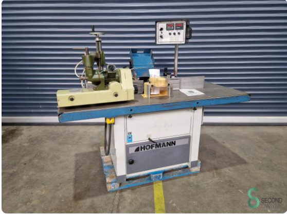
Table milling/spindle milling - Hofmann TFS 1200