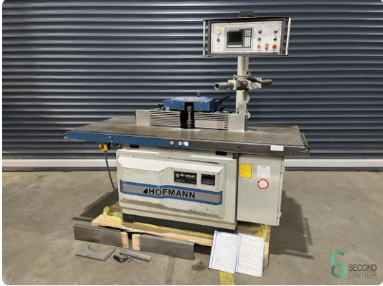
Table milling/spindle milling - Hofmann TFS 1245