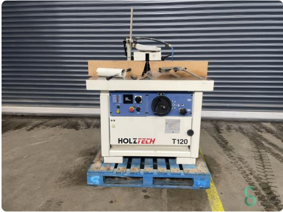
Table milling/spindle milling - Holztech T120