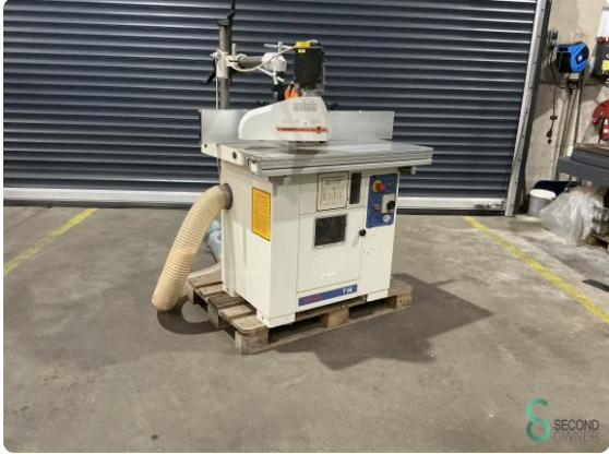
Table milling/spindle milling - Minimax T 50