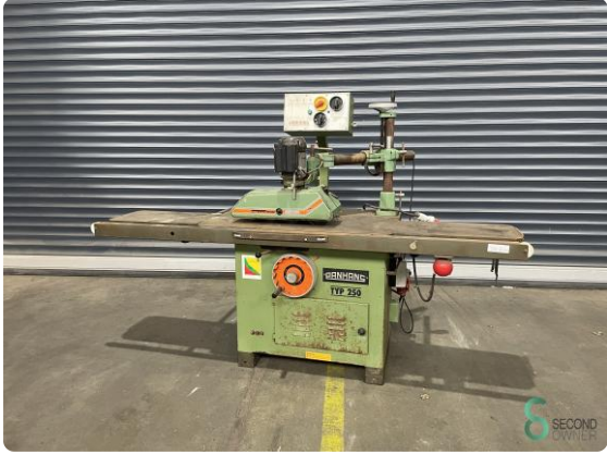
Table milling/spindle milling - Panhans Typ 250