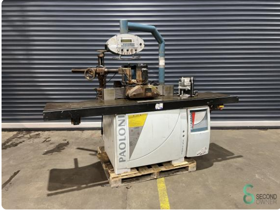
Table milling/spindle milling - Paoloni TX 160 L