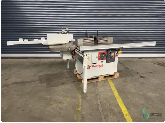
Table milling/spindle milling - Robland