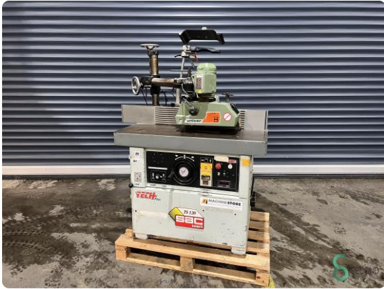
Table milling/spindle milling - SAC TS 120