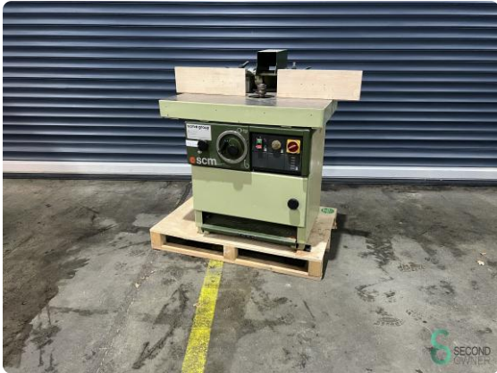
Table milling/spindle milling - SCM T 110