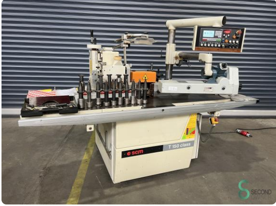
Table milling/spindle milling - SCM T 150 Class