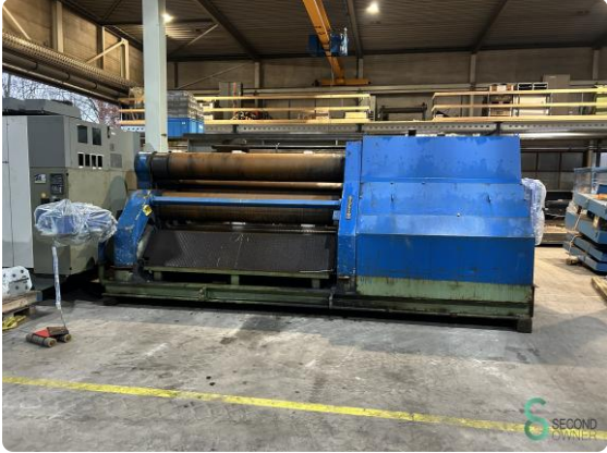
Plate roller - Stölting SRAH 2500x25